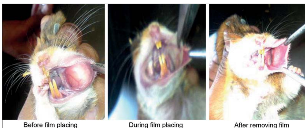
Figure 3b: PBT F3 optimized film safety study on hamsters

compliance, with all class of patients. From the in vivo animal safety studies, it was concluded that the optimized formulation had no irritation or redness on cheek pouch area of hamster and had good acceptability for oral use in treatment of epileptic attack or seizures.