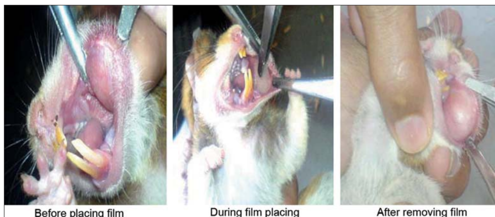
Figure 3a: Placebo film safety study on hamsters